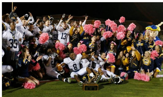
2015 – Colonia 27 – Woodbridge 26

In a game with four lead changes in the second half, the Colonia High School football team pulled out a 27-26 win over Woodbridge in its annual rivalry matchup. In doing so, the Patriots earned the Woodbridge PBA's Bragging Rights trophy for the fourth season in a row. Colonia leads the all-time series 26-18-5.