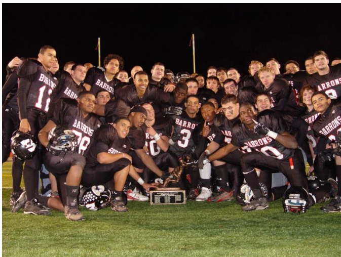
2008 - Woodbridge 14 - Colonia 12

In those early years, all three schools competed against each other on the Football field. Somewhere along the line, annual games pitting Woodbridge and Kennedy were not scheduled. But, Woodbridge and Colonia continued and they have faced off every season since 1967, the year Colonia HS initially opened their doors.