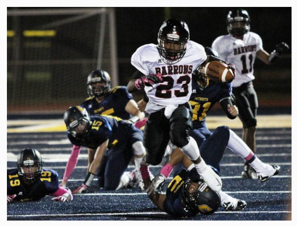
Game 6 - Colonia Patriots Woodbridge Police PBA / SOA "Bragging Rights Trophy Game"

GMC White Division Game Friday, October 16, 2015 7pm Record - Updated 10-18-2014 19 Wins - 25 Lost - 4 Ties Last Game: October 17, 2014 Result: COL 49 - WOOD 27