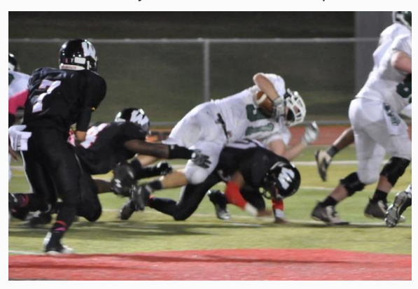
Game 9 - TBA

NJSIAA - NJ2, G4 - Playoffs - Round One Friday, November 13, 2015 TBA Last Game: November 14, 2014