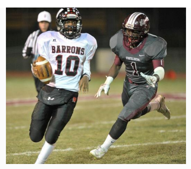
Game 10 - TBA

NJSIAA - NJ2, G4 - Playoffs - Round Two Friday, November 20, 2015 TBA Last Game November 21, 2014 Result: PBG 34 - WOOD 13