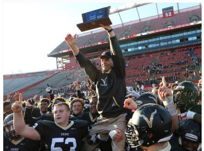
High School football, Old Bridge vs. South Brunswick in Central Group V football championship, Piscataway, NJ, December 5, 2015.