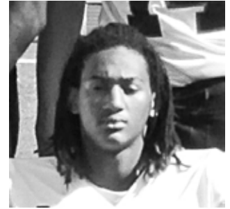
John Carpenter 4