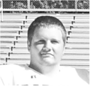
John Alcott 62